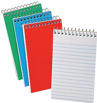
fig. 1 3" x 5" top spiral notepad